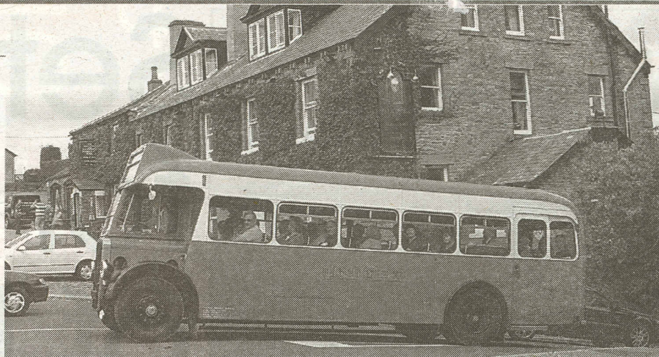
JUST THE TICKET: Go on a real ale tour of the dales; treat someone to handmade soaps, below right