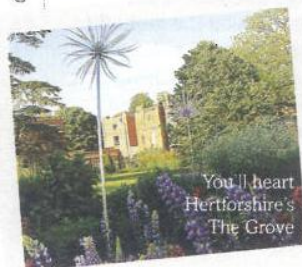
You'll heart Hertfordshire's The Grove

Smooth 'n' soothe: Work off all those ice creams with a dance class, or some aquarobics in the indoor pool. Then, be massaged, peeled, body-wrapped and detoxified with a Russian Bath treatment (£156 for three hours). The session starts in the sauna (to open the pores), then a dip in a plunge pool (to close 'em) and