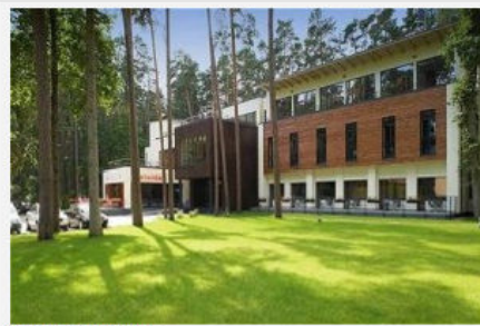
Jurmala's Amber Spa.

Back in the washing area, my Russian therapist beckoned me to place my hands in a bucket of lukewarm water, before dumping a bucket of melt-off from the polar ice cap over my head. As if the tooth-rattling shock of the first bucketful wasn't enough, I was drenched with several buckets of ice water before getting massaged through mounds of soapy lather. As shocking as aspects of the treatments had initially been by the end of the day I was feeling refreshed and elated, and as light and giddy as a hot air balloon.