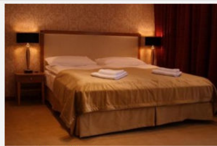
Accommodation at Amber Spa.

That night, we adjourned to its venerable in-house fine-dining establishment, My Life Restaurant . The food is fresh and hearty and owes everything to the surrounding woods and waters. Giving a modern spin to traditional Latvian-Russian staples, the menu is strikingly refreshing. Here, Latvian appetizers reign supreme: the tender veal-filled cabbage rolls I ordered were so unfathomably flavoursome that I was tempted to order an extra portion. In the atmospheric ambiance, we devoured grilled-to-perfection sirloin steak, fresh herring with baked potatoes and the award-winning bread pudding.