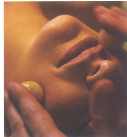
Facilities include a boutique hotel (left), a bowling alley, a restaurant, a gym, a spa (above) and a refurbished 1960s bathhouse