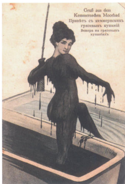
The centre was inspired by the heritage of Jurmala, which included mud treatments

We take a look at the International Wellness Centre in Latvia, where the approach is all about holistic wellness