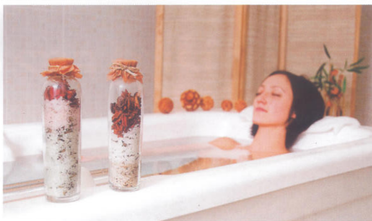
The spa menu includes the usual range of à la carte treatments and day spa packages, but the main offering includes locally-influenced treatments such as hydrotherapy, body wraps and amber stone massages