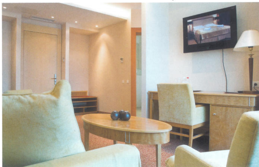
The full six-week programme, including a week at the spa and hotel (full board) costs €1,500

"And, finally, we have the restaurant and the bowling club, which gives us access to people who might not naturally come to us